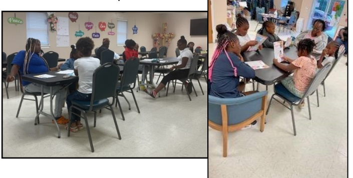
NBPC- June 15-17, 2023

Hebron Zion Presbyterian Church School Department held a successful Vacation Bible School on June 12-16th with 12 children on average attending each evening. A special thanks is extended to the volunteers and parents for bringing the children to learn and fellowship.