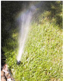
Figure 5: Rotor heads rotate slowly sending out one or more streams of water to cover areas larger than spray heads.

All heads on a zone should be of the same type with the same manufacturer's precipitation rate (amount of water sprayed in inches per hour). If heads are mixed, the landscape receives too much water in one area and too little water in other areas. For example, rotor heads (Figure 5) release 1/3 the amount of water of spray heads (Figure 6) in the same run time. Do not install rotors and spray heads on the same zone.