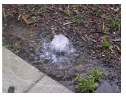
Figure 3: A broken sprinkler head wastes water.

Over time, wear and breakage in a sprinkler system leads to water waste and malfunctions. Maintenance is required on an ongoing basis to make efficient use of water. For example, missing or broken heads will cause wet spots and water runoff from the landscape (Figure 3). Replace heads immediately. Sprinklers positioned to spray hard surfaces cause water runoff and often dry spots in landscapes. A spray head nozzle can easily be unscrewed, removed, and then reinserted in the body aligning the nozzle pattern with the plants to be irrigated.