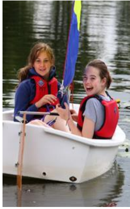
Girls having adventures