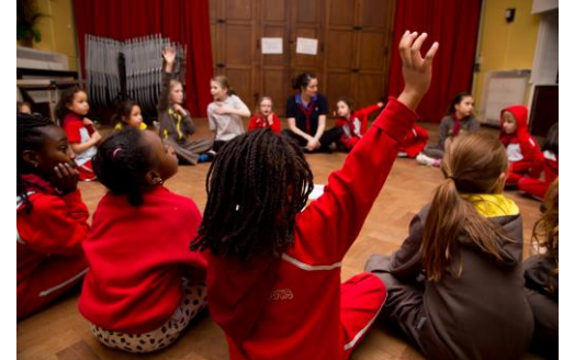
Good retention and transition