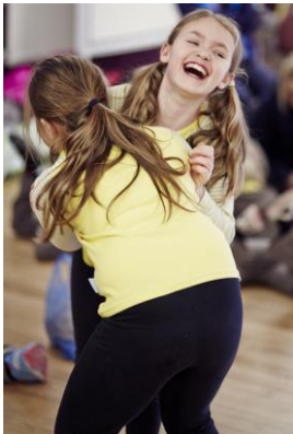
Girls having fun in a safe environment