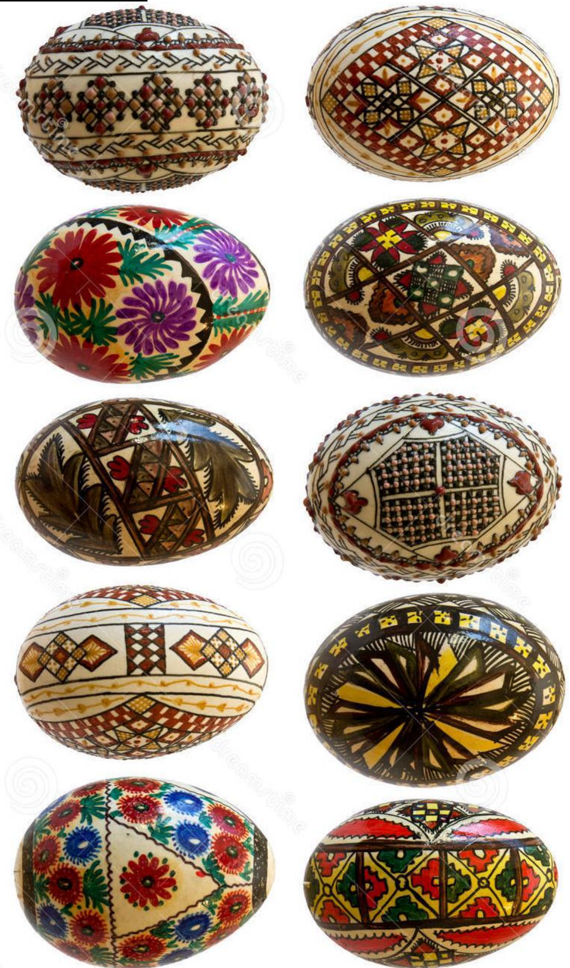
Page 11 of 15