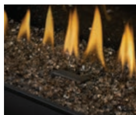
Glass embers (blue, amber, black, topaz, clear, red)

Glass beads and embers can be added to any log set