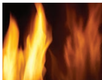
MIRRO-FLAME® porcelain reflective radiant panels