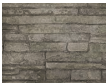
Ledgestone brick panels