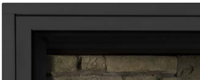
Adjustable 4pc 5/8" finishing trim for installations that require more coverage