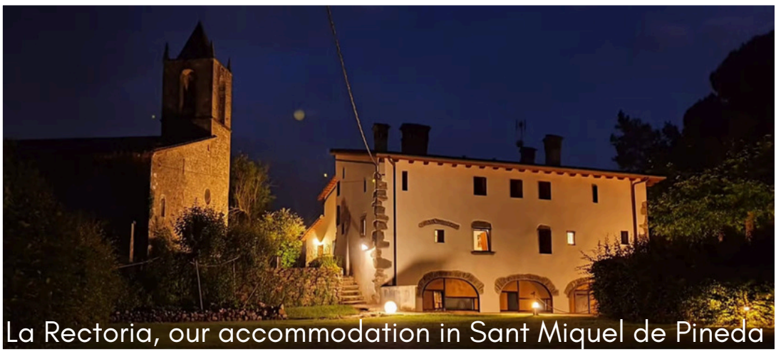
La Rectoria, our accommodation in Sant Miquel de Pineda