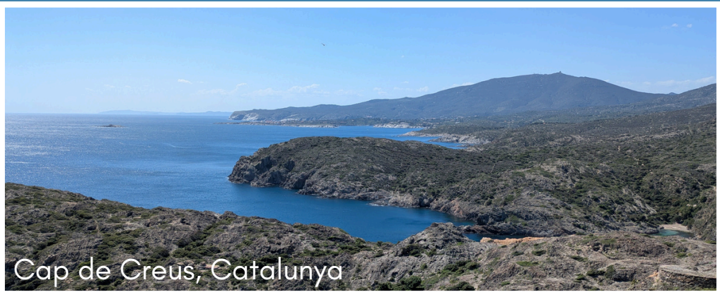
Cap de Creus, Catalunya