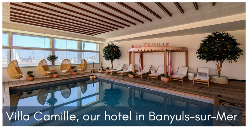
Villa Camille, our hotel in Banyuls-sur-Mer