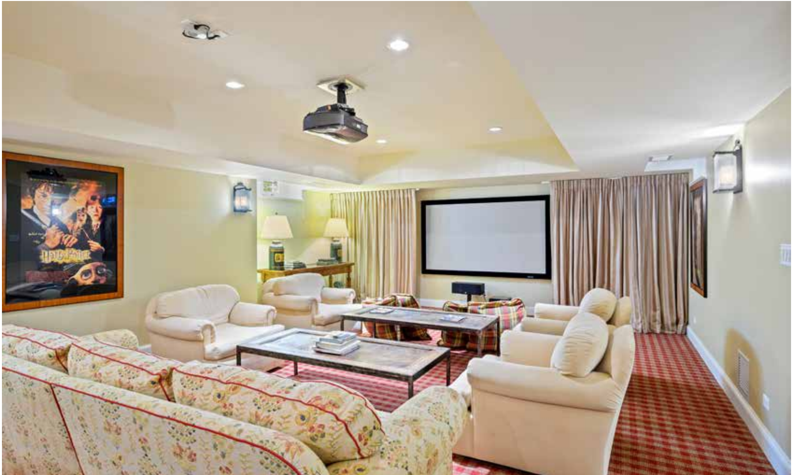
lower level media room