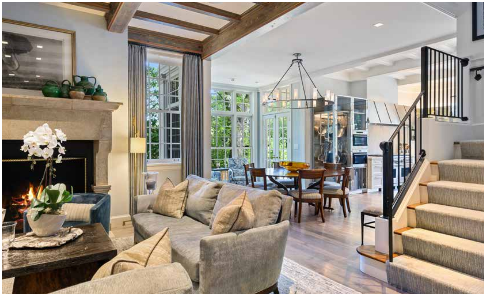
family room/breakfast area