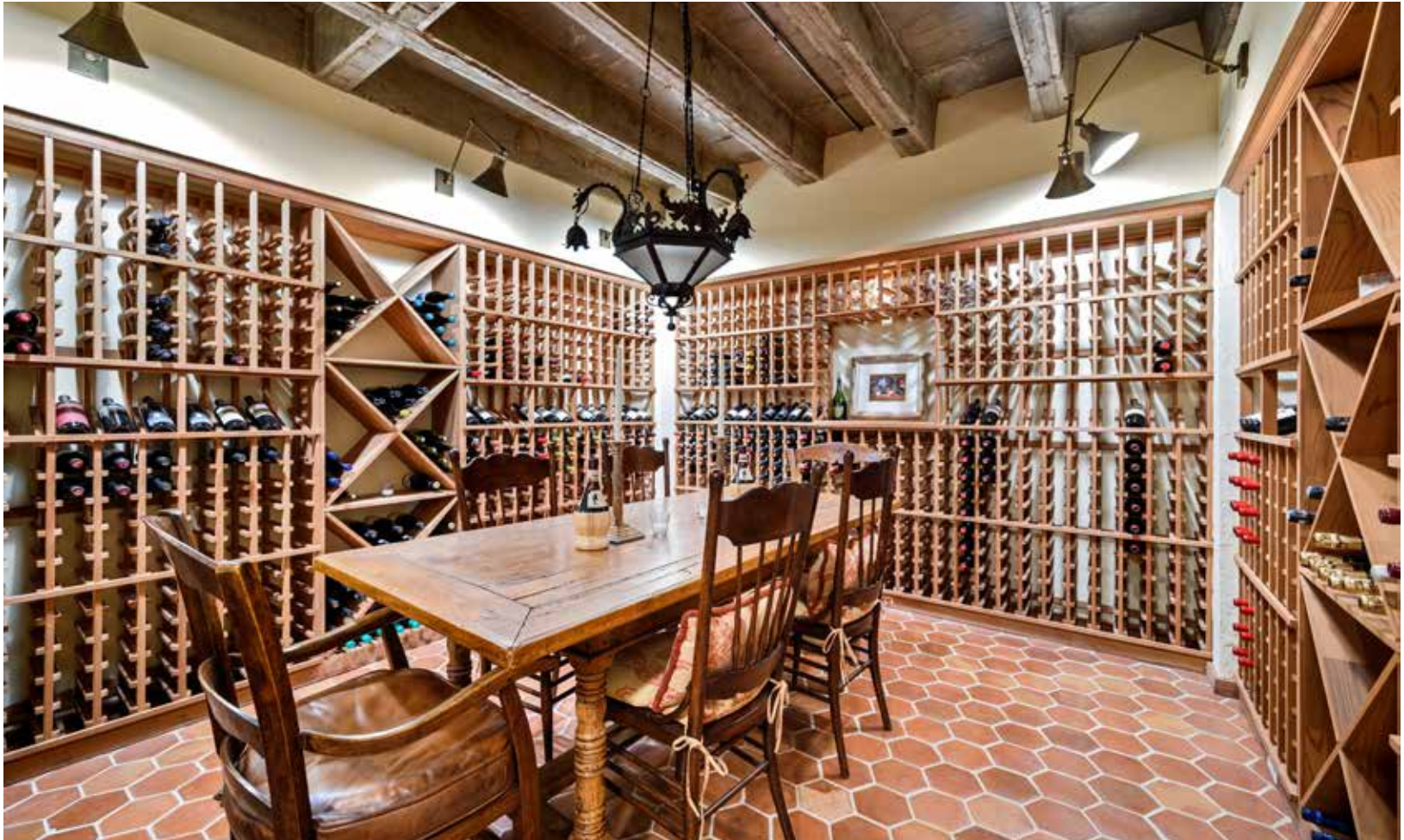
lower level wine cellar