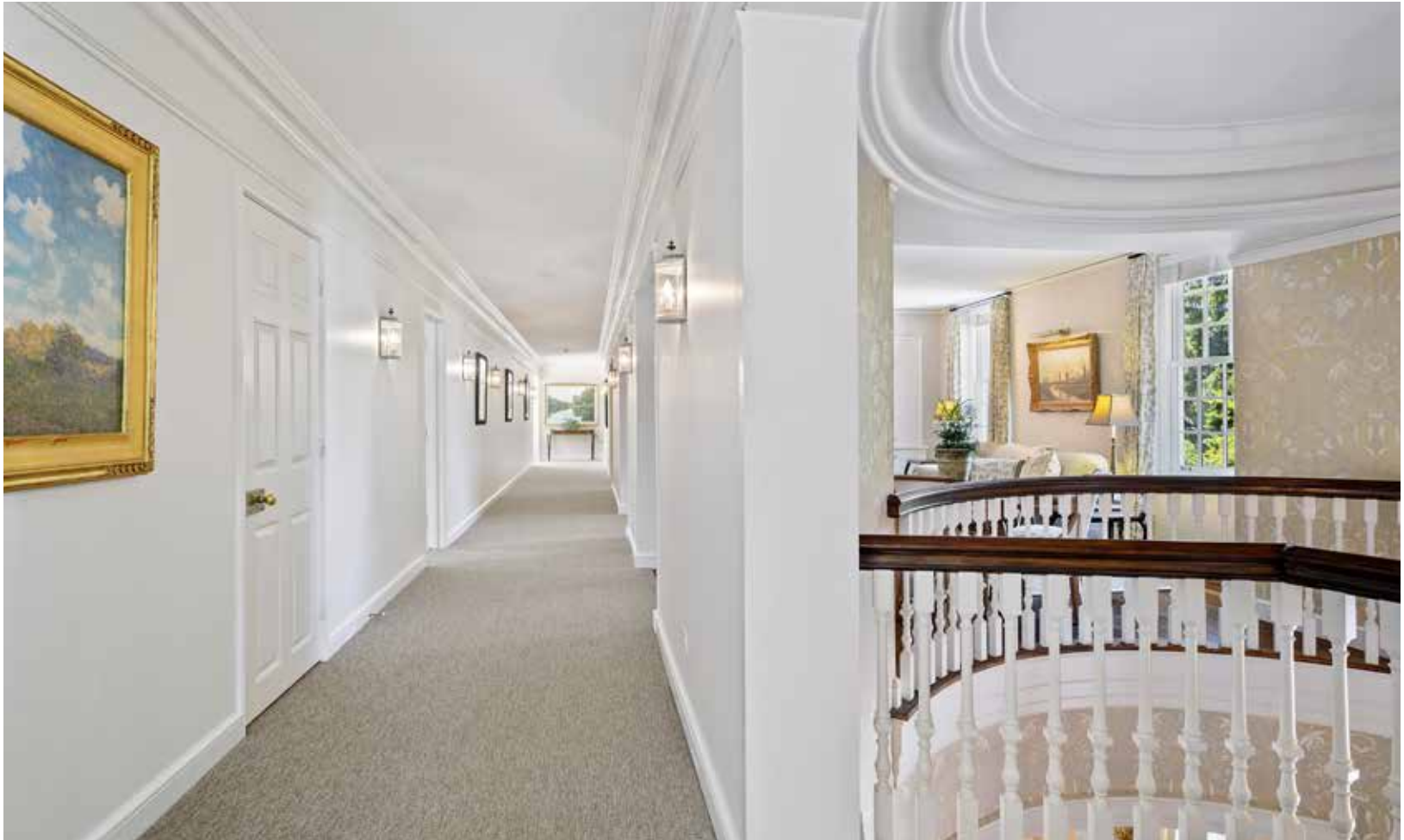
second level hallway