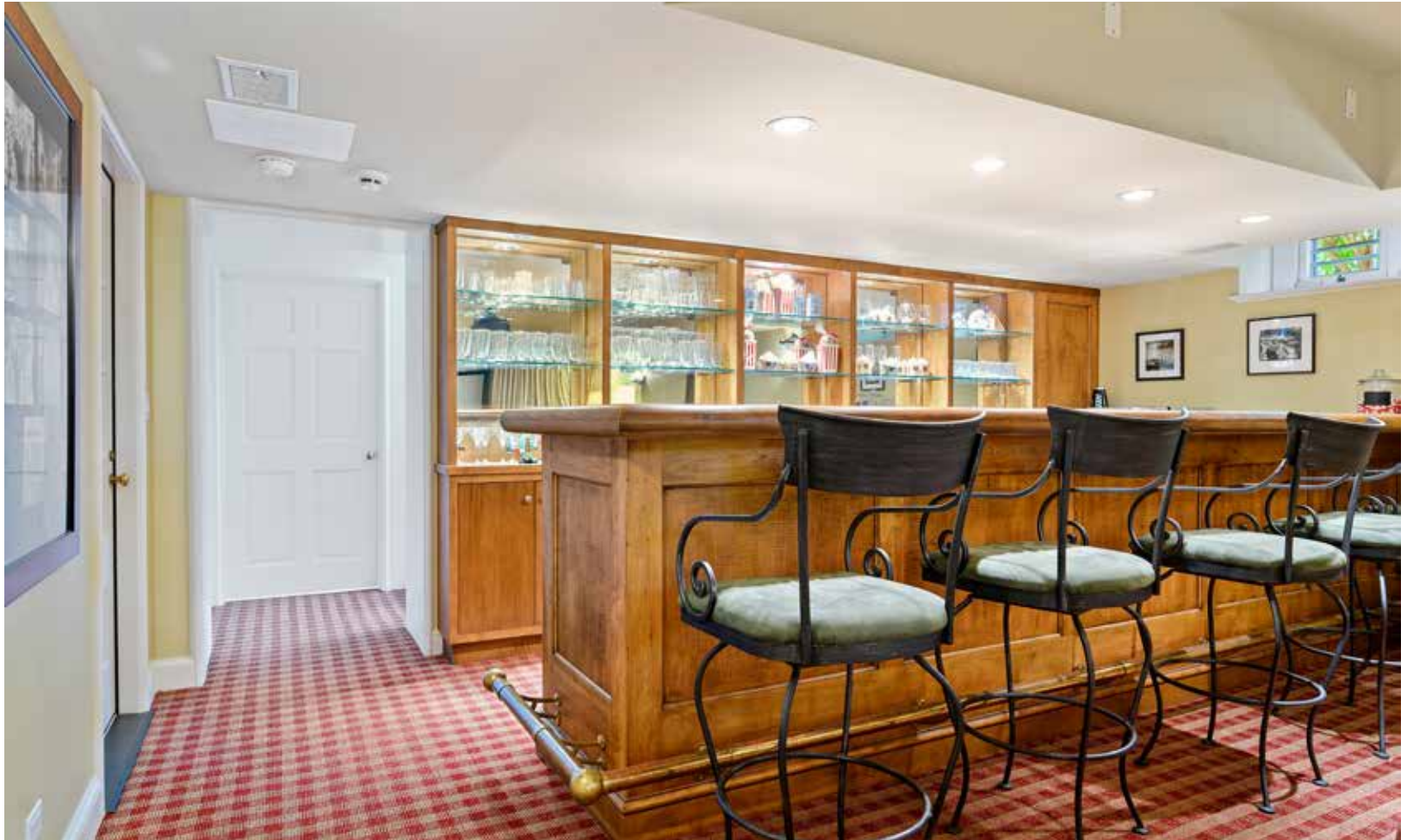
lower level bar