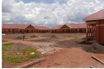
ACT Secondary School