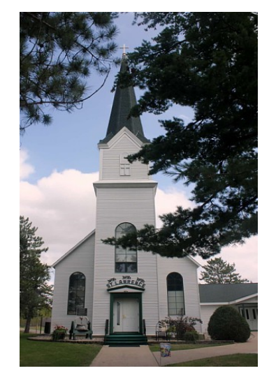
July 25, 2021 Seventeenth Sunday in Ordinary Time

St. Lawrence Catholic Church of Rush Lake 46404 County Highway 14 Perham, MN 56573 Phone: 218-346-7729 Email: stlawrence@arvig.net