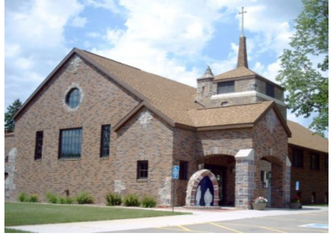
Sacred Heart Catholic Church of Dent 36963 State Highway 108 Dent, MN 56528 Phone: 218-758-2700 Email: sacredheart@arvig.net