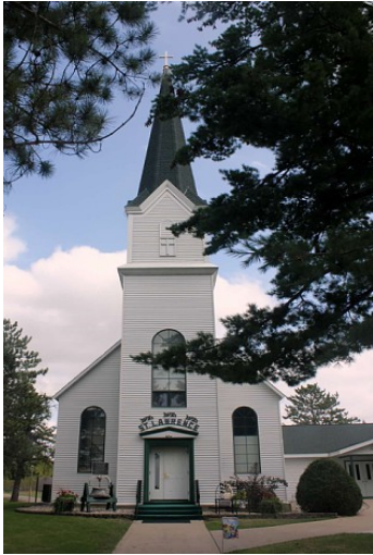
St. Lawrence Catholic Church of Rush Lake 46404 County Highway 14 Perham, MN 56573 Phone: 218-346-7729 Email: stlawrence@arvig.net

August 1, 2021 Eighteenth Sunday in Ordinary Time