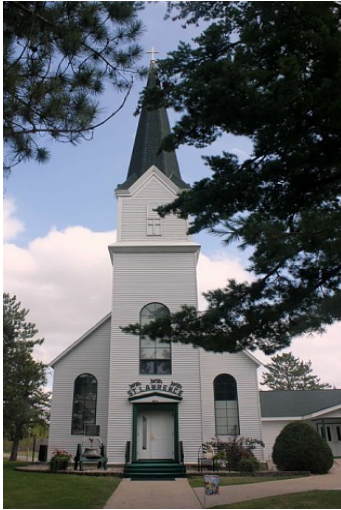
St. Lawrence Catholic Church of Rush Lake 46404 County Highway 14 Perham, MN 56573 Phone: 218-346-7729 Email: stlawrence@arvig.net

September 12, 2021 Twenty-fourth Sunday in Ordinary Time