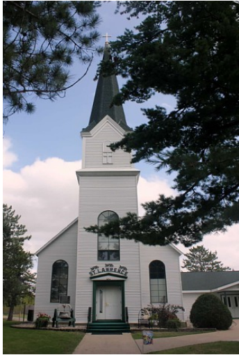
St. Lawrence Catholic Church of Rush Lake 46404 County Highway 14 Perham, MN 56573 Phone: 218-346-7729 Email: stlawrence@arvig.net

September 27, 2020 Twenty-Sixth Sunday in Ordinary Time