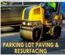
PARKING LOT PAVING & RESURFACING

The Sacred Heart parking lot will be resurfaced and striped soon. Once it is completed the parking lot will be blocked off for several days. If you see that it is blocked off please do not enter but rather park on the city street. Thank you.