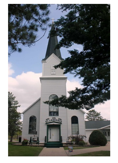
December 20, 2020 Fourth Sunday of Advent

St. Lawrence Catholic Church of Rush Lake 46404 County Highway 14 Perham, MN 56573 Phone: 218-346-7729 Email: stlawrence@arvig.net