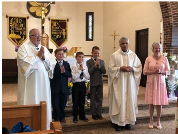
Congratulations to our Sacred Heart First Communicants

Sun., May 7: Confirmation/Senior Breakfast; after 8:30AM Mass.