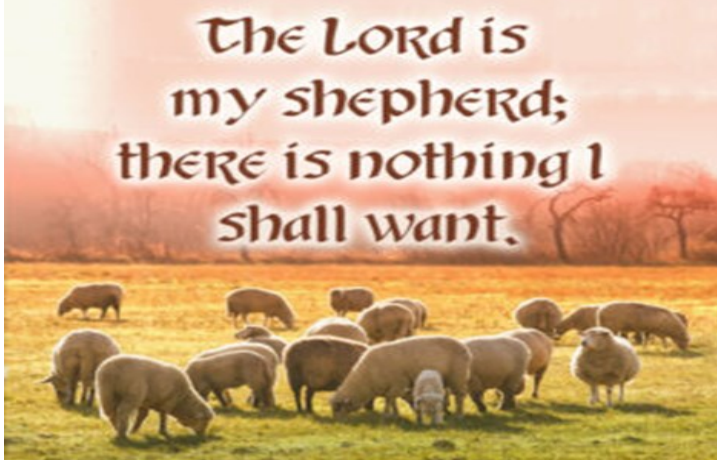
Northern Cross Area Catholic Community

Thank you for remembering St. Lawrence Church with your Stewardship throughout the year.