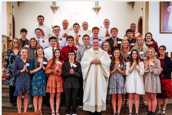
Congratulations to our NCACC Confirmation students who received the Gift of the Holy Spirit on April 20th at St. Henry. Keep them in prayer.