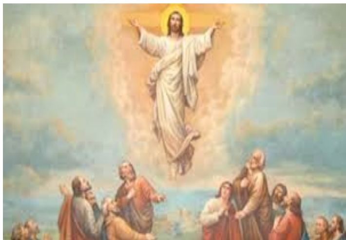
The Ascension of the Lord