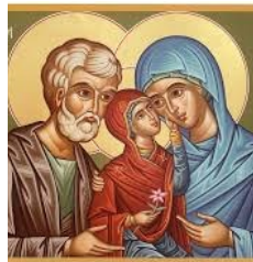
St. Joachim & St. Anne July 26