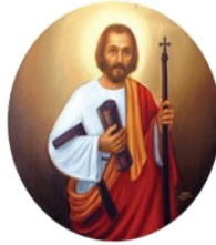
St. Thomas , the Apostle July 3rd