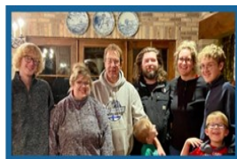
FROST FAMILY BENEFIT