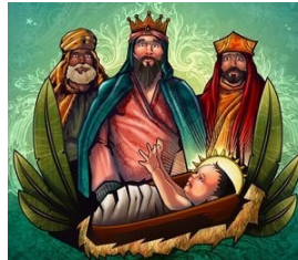
The Epiphany January 5th