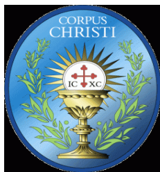
Corpus Christi June 7