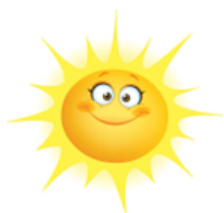
First Day of Summer June 21