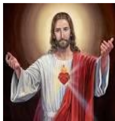
The Most Sacred Heart of Jesus—June 12