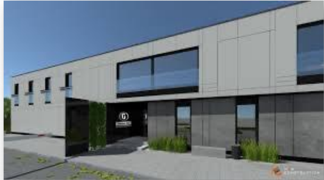
MIRACLE HONESTY FOUNDATION