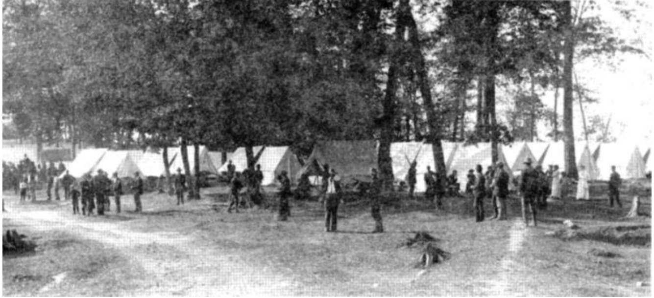
A rare photograph of Camp Ishpeming. Note the troops still on guard duty, the wandering civilians and numerous unsecured weapons.

At 7 a.m. the Companies were detailed off to the different mines where they would protect life and property. The Ironwood Company of 62 men and Houghton's 57 men went to the Lake Superior Mine; Calumet with 70 men went to the Lake Angeline Mine; Cheboygan with 50 men marched to the Salisbury Mine; and Marquette's Company G of 45 men was given the responsibility of securing the campsite. Later the Cheboygan unit was transferred to the Buffalo Mine in Negaunee and Calumet to the Champion Mine. 36