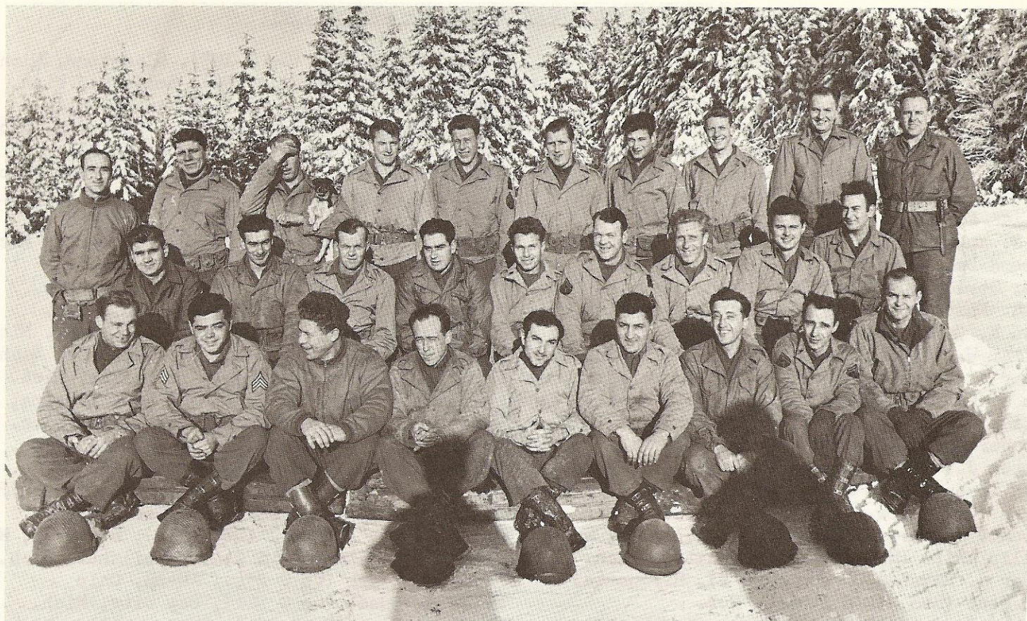
Headquarters Platoon, Company B 254th Engineer (C) Battalion)