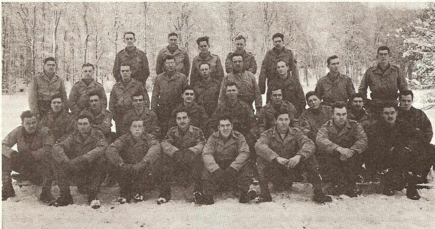
Headquarters Platoon, Company A 254th Engineer (C) Battalion