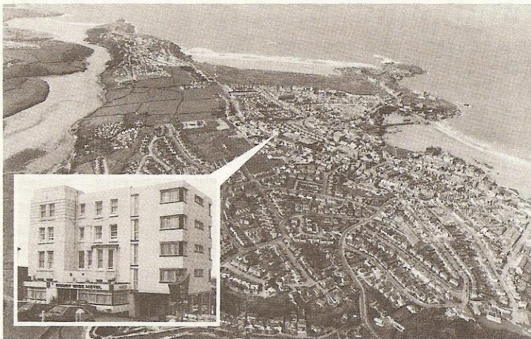
Mount Wise Hotel and aerial view of Newquay today - from brochure sent by Sid Green

remember the hotel where the 254 had its Bn Hq CP - helluva thing for an S-2 Section member to admit but dammit that was 43 years ago!