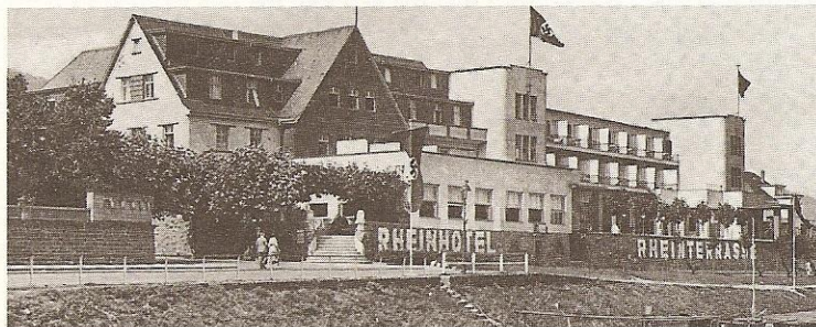
1945 photo of Rhein-Hotel, Bad Niedereisig wife of the 254's Victor Bridge crossing

and with the Rhein-Hotel in mind a contribution from George W. Waldron (Co C 254) is a pre-war tourist booklet touting the many features of the hotel in German, Austrian, French and English. Most of the 254 was billeted in the hotel's "100 cheerful and comfortably furnished rooms with 130 beds" while pushing the bridge across the Rhine River. According to George: "In the upper right hand corner of the hotel, I got hit near my left eye with pieces of wood and plaster when the Krauts across the river threw some shells in the area. Severed a nerve causing a twitch that I've learned to control but the incident never got on my re-