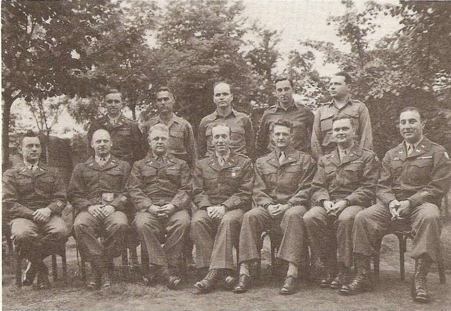
1121st Engineer Group Hq Officers