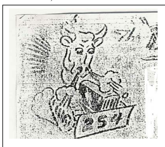
THE BULL SHEET Issue No 1, 06 Nov 44

(Editor's note: The copy I had for the original "Bullsheet" was too poor to scan and enter here as original text. Therefore I retyped it so it could be read.)