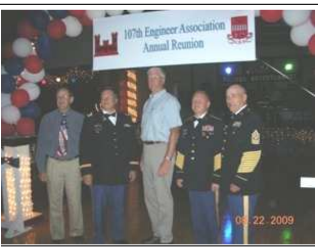
Past & present Battalion Commanders and Command Sergeant's Major