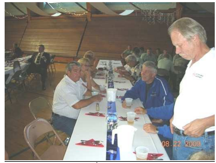
1432<sup>nd</sup>/Co B retirees

Future Reunion Locations , Here are the proposed locations, subject to approval of the membership, for the next 3 years; <u>2011</u>, <u>Kingsford</u> (The 50<sup>th</sup> Annual Reunion. The last time the reunion was in Kingsford was 1991, because the units assigned to the armory have not been a part of the battalion. Now they are back in the fold.), <u>2012</u>, <u>Gladstone</u>, <u>2013</u>, <u>Calumet</u>. It is difficult to set locations too far in advance because we never know when one of our units will be mobilized or perform AT out of the state or country.