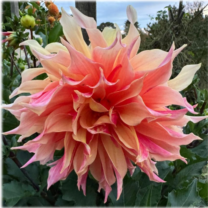
The eye catching and charming collarette Pooh from my sister