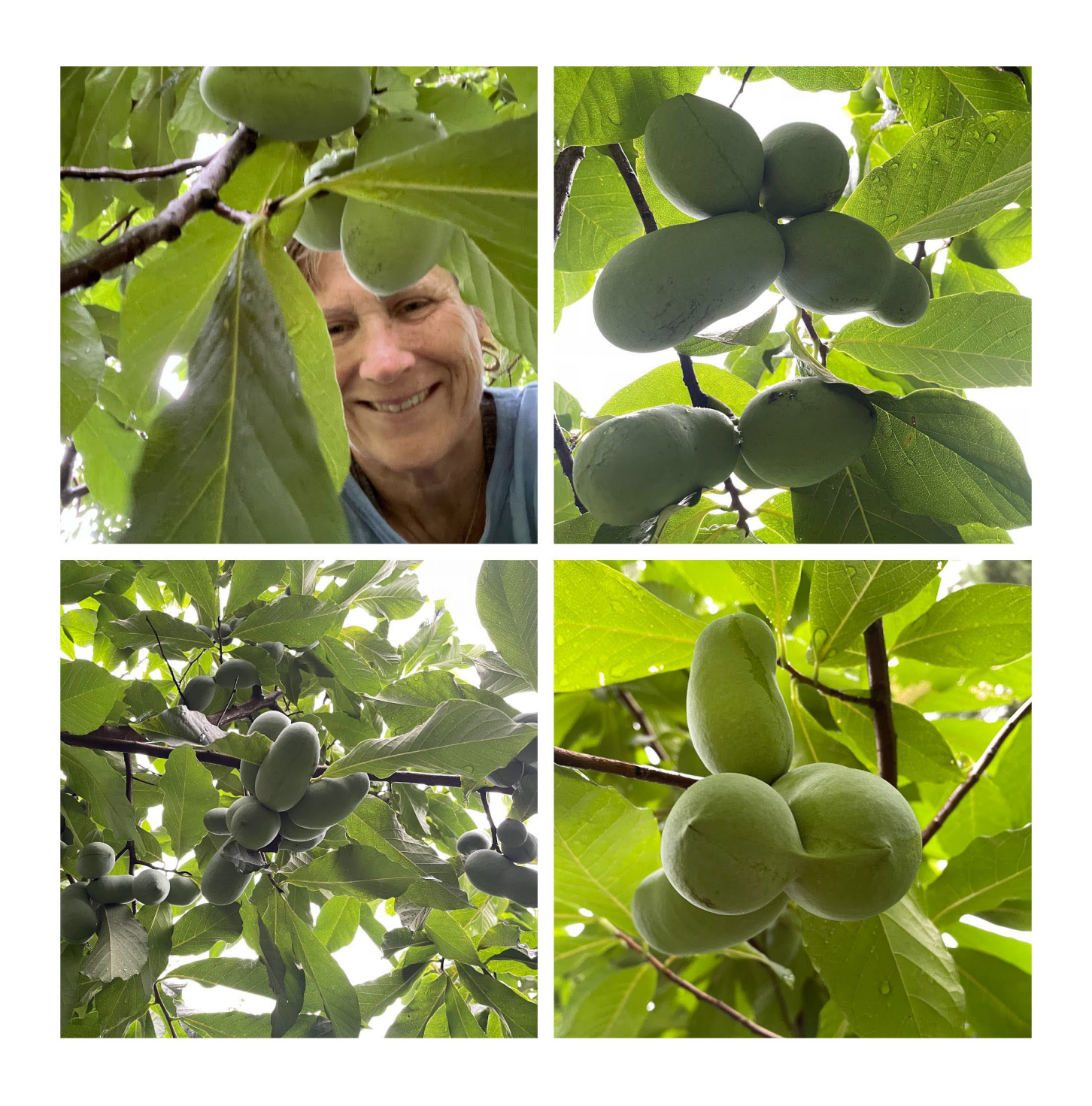
Including Self-Portrait of a Happy Gardener

Pawpaw Fruits Tolerate Temperature Dips into the Mid-20s. This fruit continued to ripen after the snowfall on October 30^{th} , 2020.