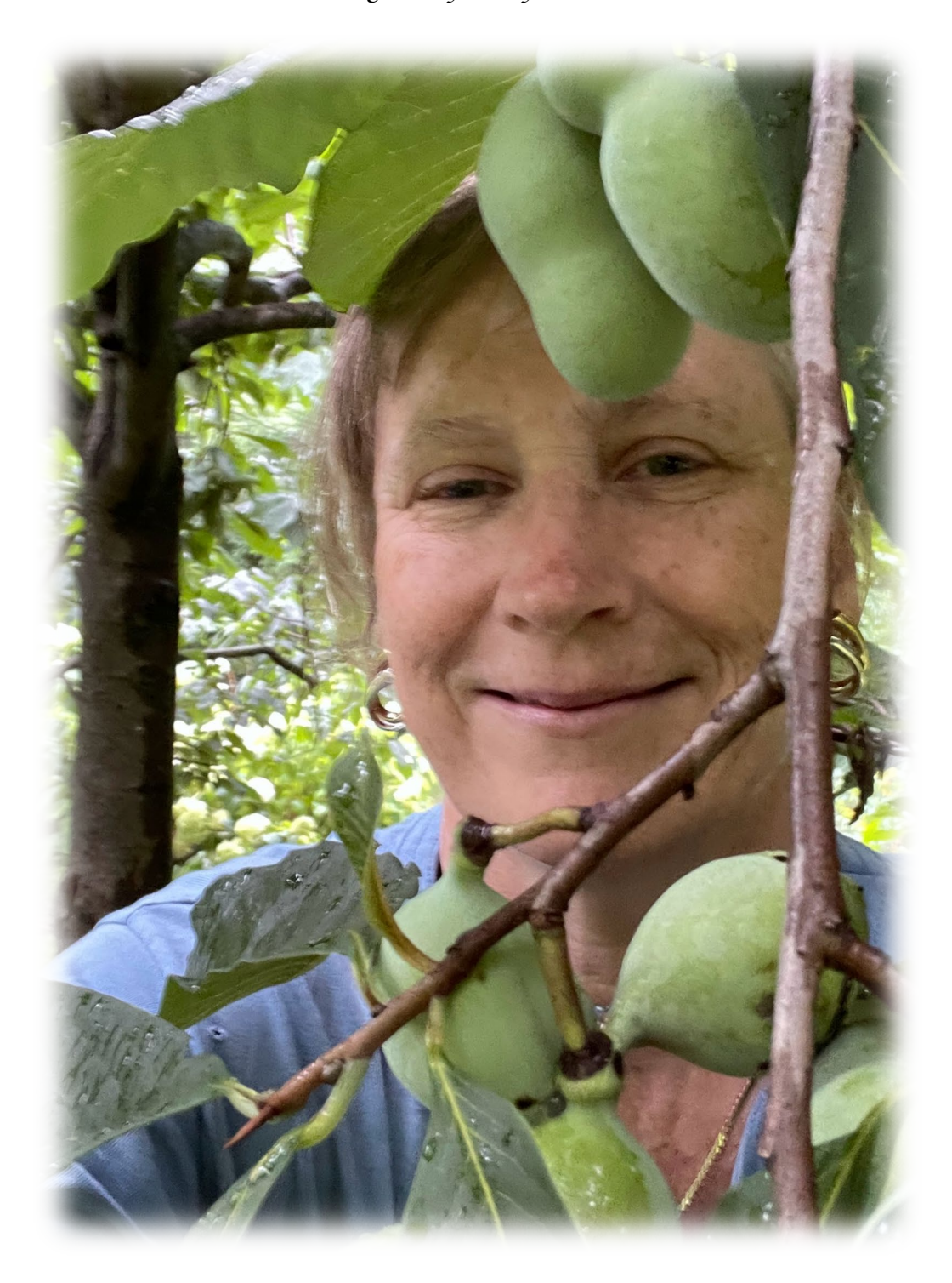
planting pawpaw trees at your home. Consider becoming the next Pawpaw Queen wearing a leaf and fruit crown.