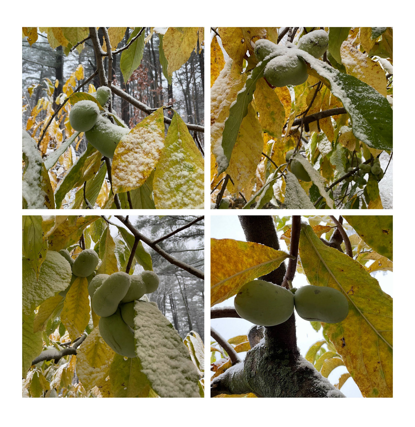
More Late October Splendor