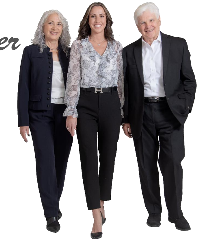
The PLINTERNATIONAL REAL ESTATE GROUP GROUP The PLINTERNATIONAL REAL ESTATE 837 Frankli

CONDITION- Are you looking for "move-in ready" or would you consider a "fixer-upper"?