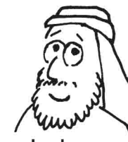
Judas (son of James)