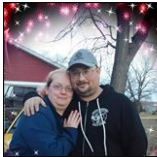
The Proud Parents!