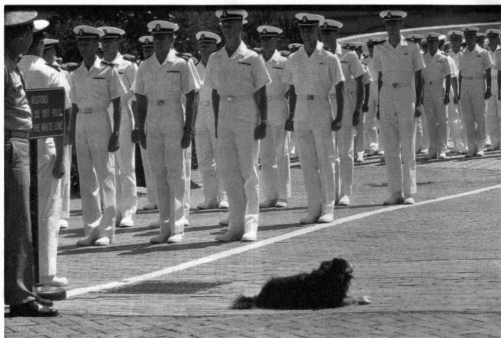
'73 Looking sharp!