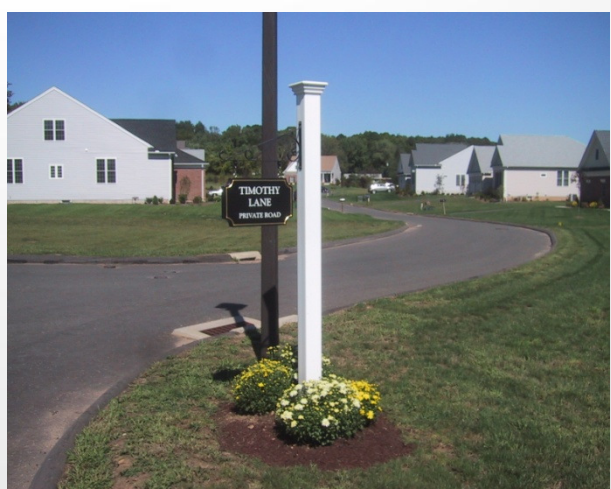
Annual Meeting November 20, 2013