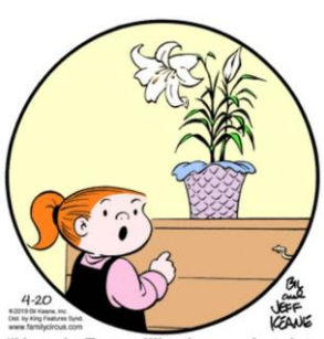
"How do Easter lilies know what date to open up their flowers?"