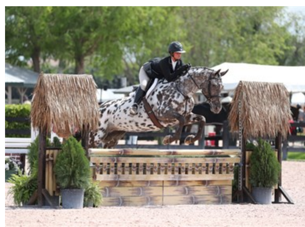
Dani in action.

Dani's unique coat color, inherited from her Appaloosa dam, may appear to be a white base coat with brown/black spots, but the dark patches are actually a genetic absence of white, revealing brown underneath. All Appaloosa patterns are a variation of white, with different allele combinations resulting in more or less white showing on the horse. Dani's leopard coloring, which resembles its namesake big cat, displays mottled brown and white over her face, chest, and lower neck, with the iconic black patches becoming clear and distinguished over her withers, barrel, and haunches, before darkening to a mostly black tail and completely black stockings on her legs.