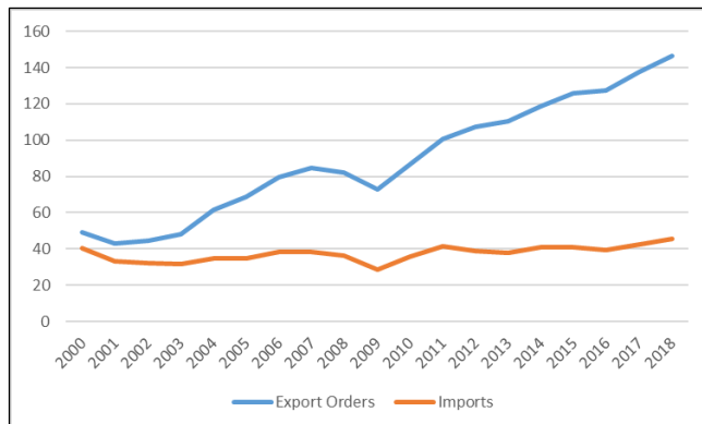
Figure 2. Comparison of U.S. Export Orders Placed with Taiwanese Firms and U.S. Data on Merchandise Imports from Taiwan: 2000-2018 ($billions)

Source: Taiwan export order data are from the Taiwan Ministry of Economic Affairs. Data on U.S. imports are from the USITC.