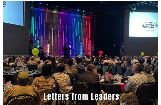
Letters from Leaders