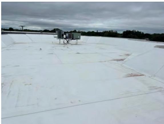
GENERAL VIEW ROOFTOP