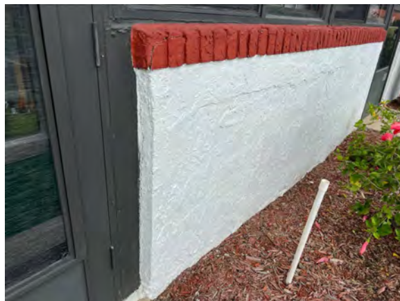
MINOR CRACKING IN EXTERIOR WALL