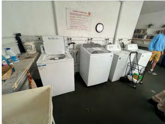
VIEW OF LAUNDRY ROOM