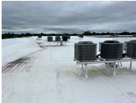
VIEW OF HVAC EQUIPMENT