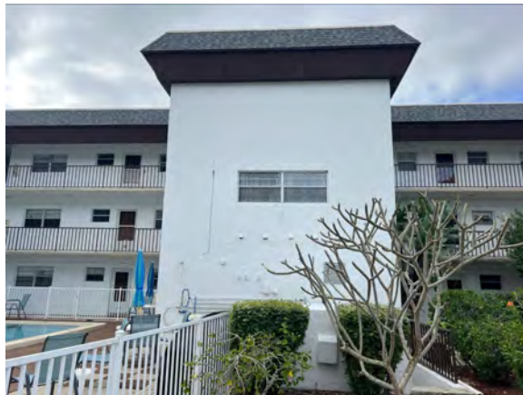
GENERAL VIEW OF BUILDING EXTERIOR FINISHES