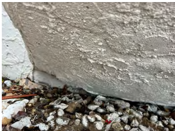
SPALLING UNDER STAIRS