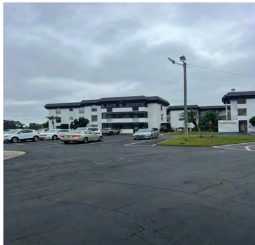
GENERAL VIEW OF PARKING AREA