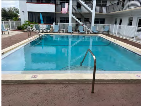
GENERAL VIEW OF SWIMMING POOL