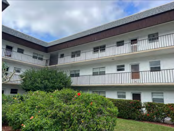
GENERAL VIEW OF BUILDING EXTERIOR FINISHES