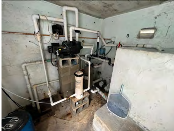
GENERAL VIEW OF SWIMMING POOL EQUIPMENT