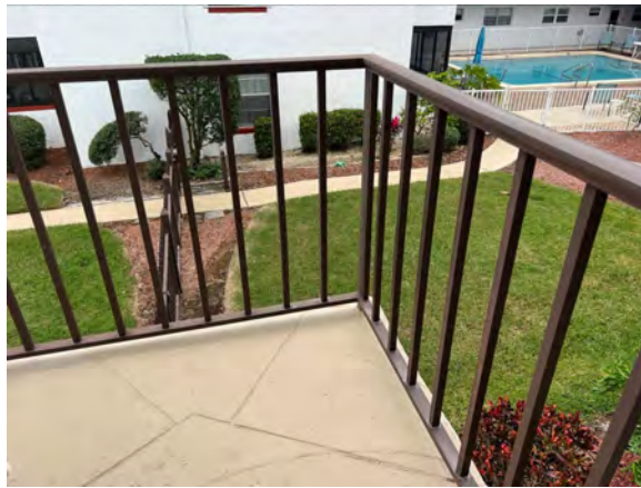
LOOSE HAND RAIL ON ELEVATED WALKWAY