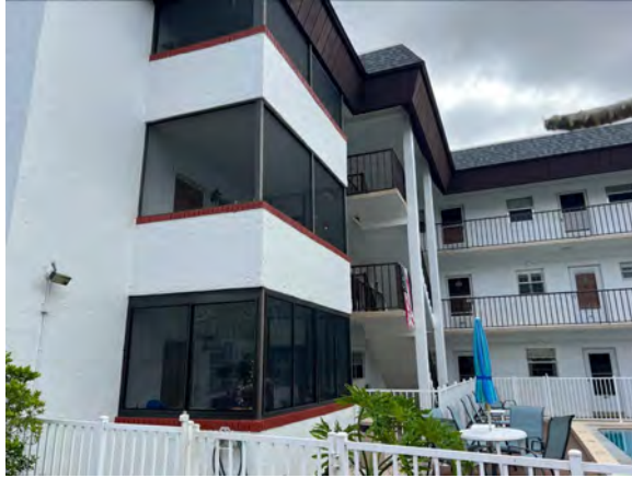
VIEW OF TYPICAL BALCONY