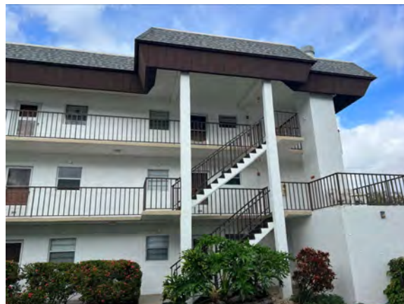
VIEW OF EXTERIOR STAIR SYSTEM