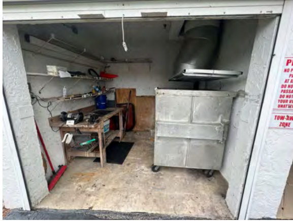
VIEW OF GARBAGE COLLECTION AREA