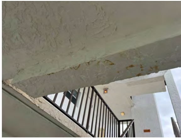
SPALLING IN BEAM SUPPORTING LANDING