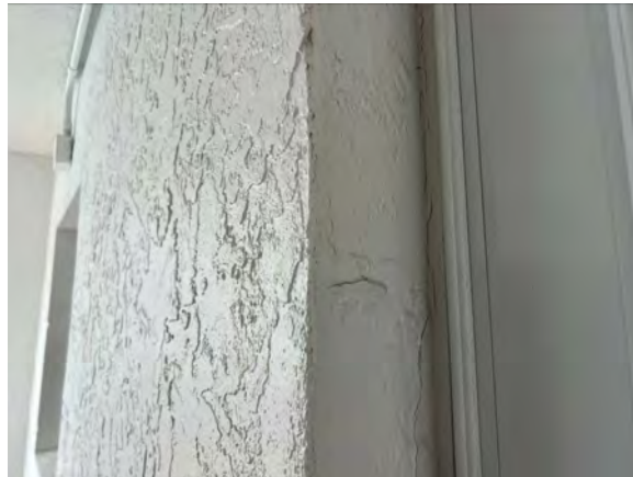
CRACKING AROUND DOOR FRAME