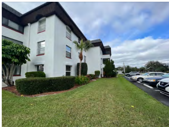
VIEW OF BUILDING EXTERIOR FINISHES