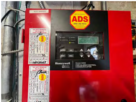
VIEW OF FIRE ALARM SYSTEM EQUIPMENT