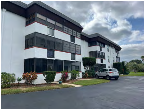
GENERAL VIEW OF PROPERTY