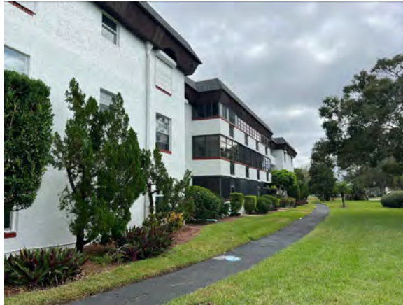
GENERAL VIEW OF LANDSCAPING