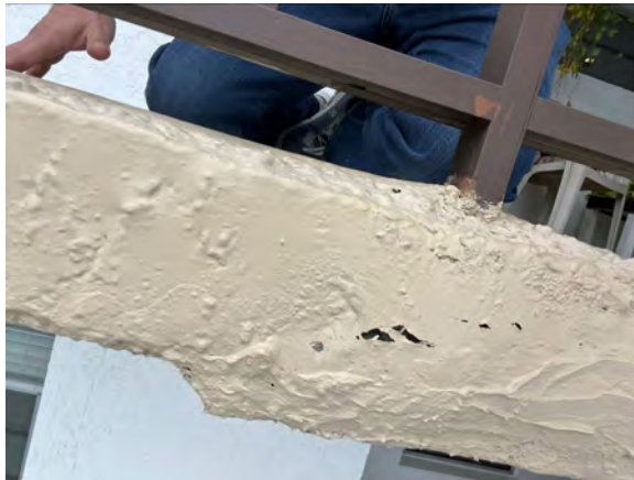
EXAMPLE OF SPALLING IN EDGE OF ELEVATED WALKWAYS