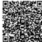
QR Code – Diced Chicken WeLearn Video, 02628

Please note that we will no longer be cutting chicken fillets for salads, although customers can still substitute Classic or Spicy fillets upon request (they will receive an uncut fillet).