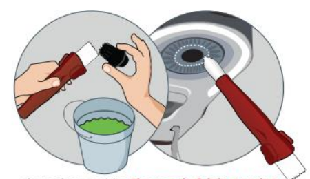
clean, then sanitize the nozzle & injector ring you must soak the nozzle tip with food grade sanitizer. Then allow to air dray for 2 minutes