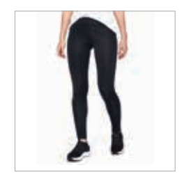
Leggings or Jeggings Baggy or sagging