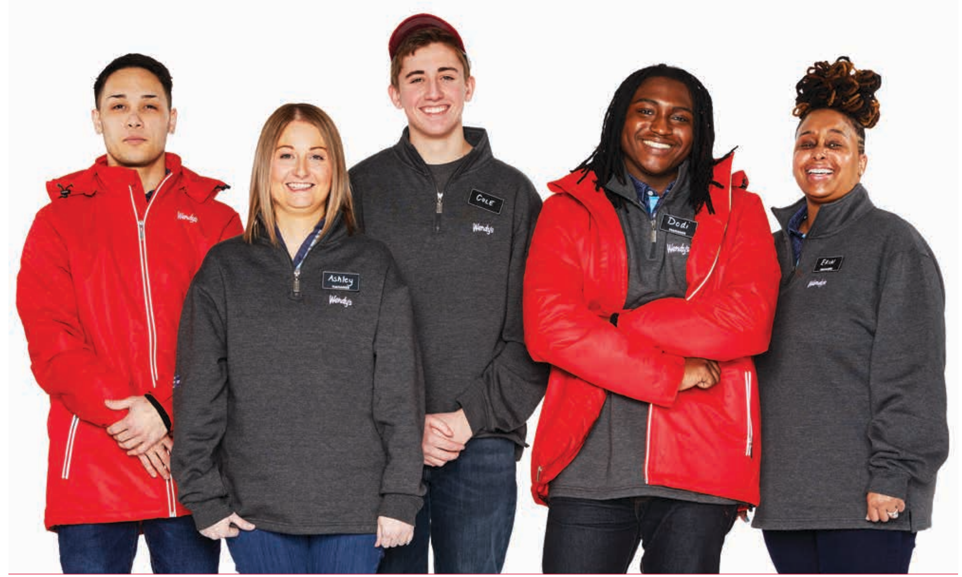
See page 9 for exceptions. For internal use only. Images and information are provided as examples only.

Cracked or damaged graphics Rips and tears Dirt or stains Non-Wendy's-approved gear