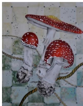
(Similar to the above)

Paola Bari: Red-Capped Mushrooms 8" x 10" tile