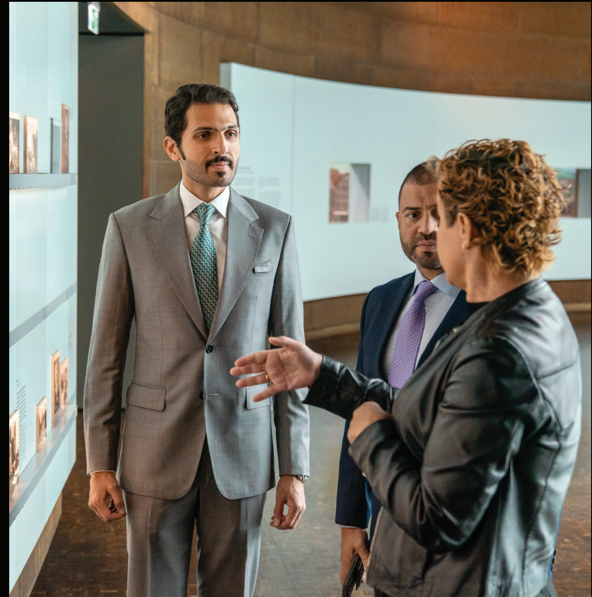
Mercedes-Benz Places | BINGHATTI