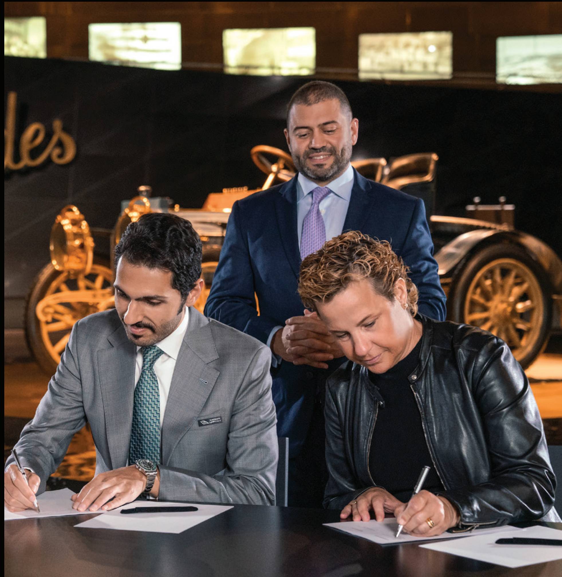
TWO VISIONARY LEADERS COLLABORATING TO CRAFT AN ARCHITECTURAL MASTERPIECE.