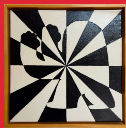
Fighting against my left brain Acrylic on canvas USD $1,800