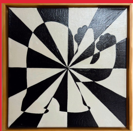
Fighting against my right brain Acrylic on canvas USD $1,800