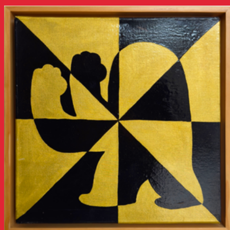
The Gold Flicker Fighter Acrylic on canvas USD $1,800