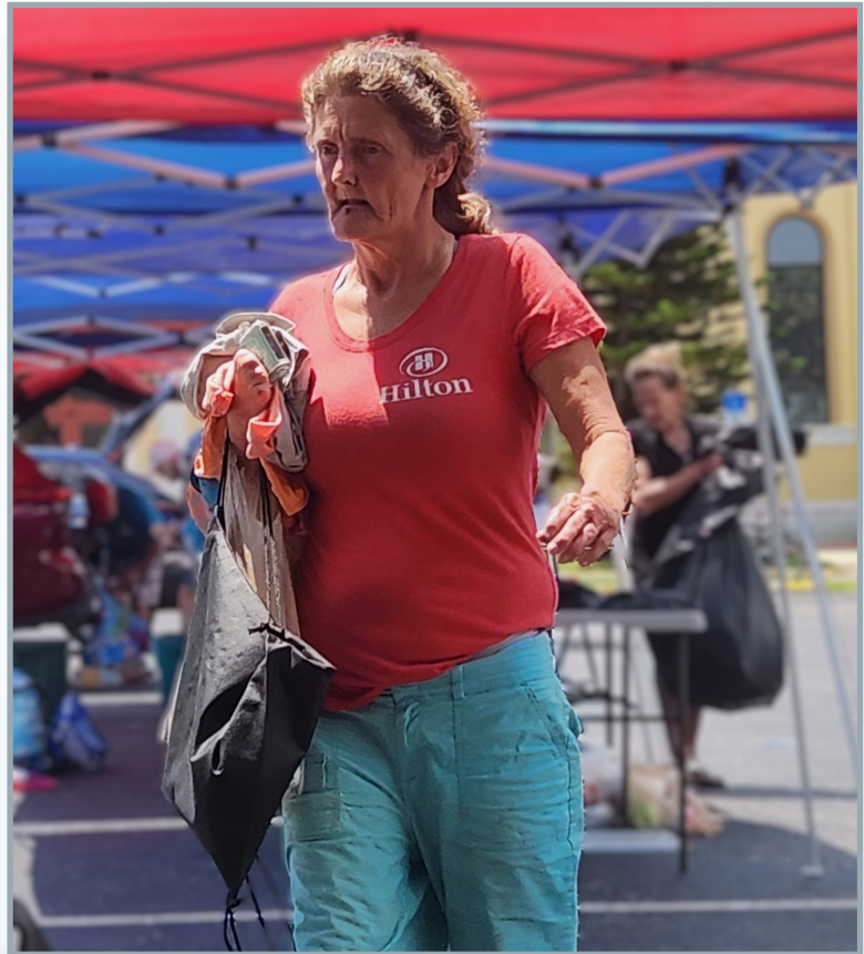
Daytona's Homeless 'Hilton'

As the sun rises, the temperature is already 78 degrees. It will be over 95 degrees soon. I rollover in my tarped lean-to, which is nestled under a bush so I can't be found. This empty overgrown lot is my home. My restless sleep is over.