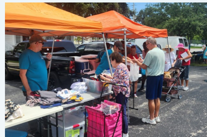
Volunteers prepare food (top) and distribute items to the needy.