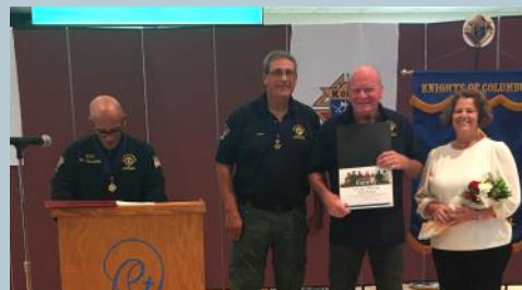
FOM The Baskins