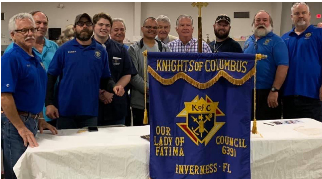
On November 16, Our Lady of Fatima Council 6391 Inverness was a sponsor of the Pregnancy Family and Pregnancy Life Center's Spotlight on Local Talent fundraiser. Many Knights and their families attended and supported the event. This center provides a vital service to expectant mothers and families in Citrus County.

Brother Knights, there has been a bill in the defense of life every one of the 11 years I have attended Catholic Days at the Capitol. I invite you to join your Diocese representatives in this noble cause.