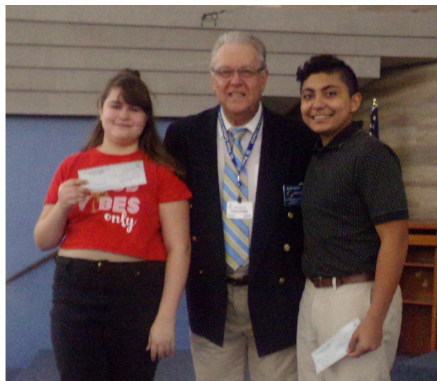
Council 10055 Fellowship Breakfast