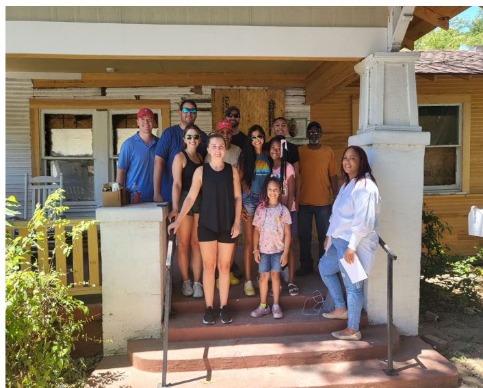
TREC Team with friends of KJGM

We are hopeful for a completed facility by October 2022. Planning for "Reading Under the Oak" upon completion of repairs. This event typically takes place during the summer months. However, due to our ongoing restoration efforts, the date has been pushed back a bit. Looking forward to presenting at least one reading under the oak event before the arrival of winter.